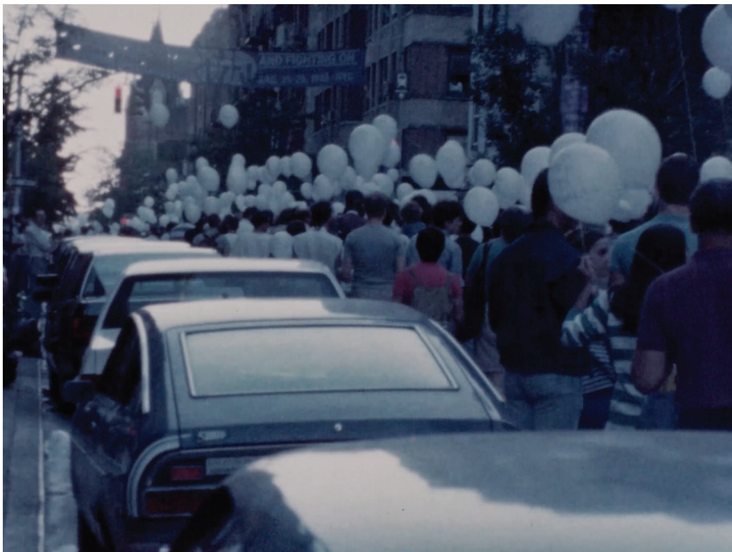
16mm film still: Candlelight Vigil, New York, NY, 1988.

For the first time the Al Larvick National Grant was awarded to a collection that was previously supported. Jim Hubbard's Super 8, 8mm and 16mm films received a 2018 and 2019 national grant. With the 2019 Al Larvick National Grant, Hubbard continued the conservation work of his collection, which documents political and community events in and around the New York City and Washington DC area from 1979-2009. Additionally, this funding makes his work accessible. 2019 national grants were also given to Norfolk Western Historical Society and Oregon Historical Society.