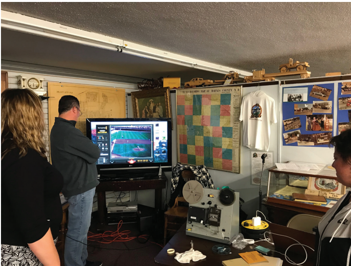
Photograph: Community digitizing event at The Barnes County Historical Society Museum, Valley City, ND, October 2019.

The Bismarck and Valley City events included the fund's first public digitizing efforts.