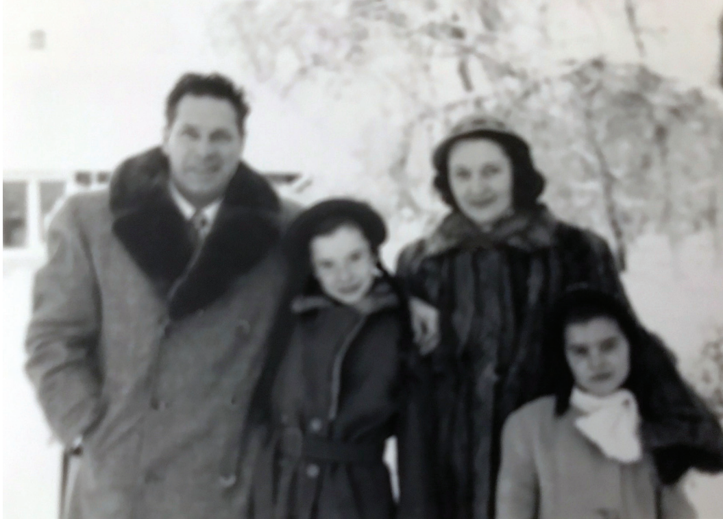
Photograph: Englert family, Valley City, ND, c.1940s.