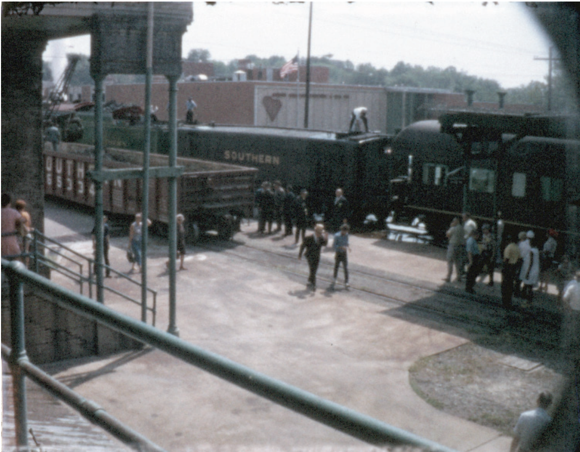
8mm film still: Train station activities, c. 1970s.