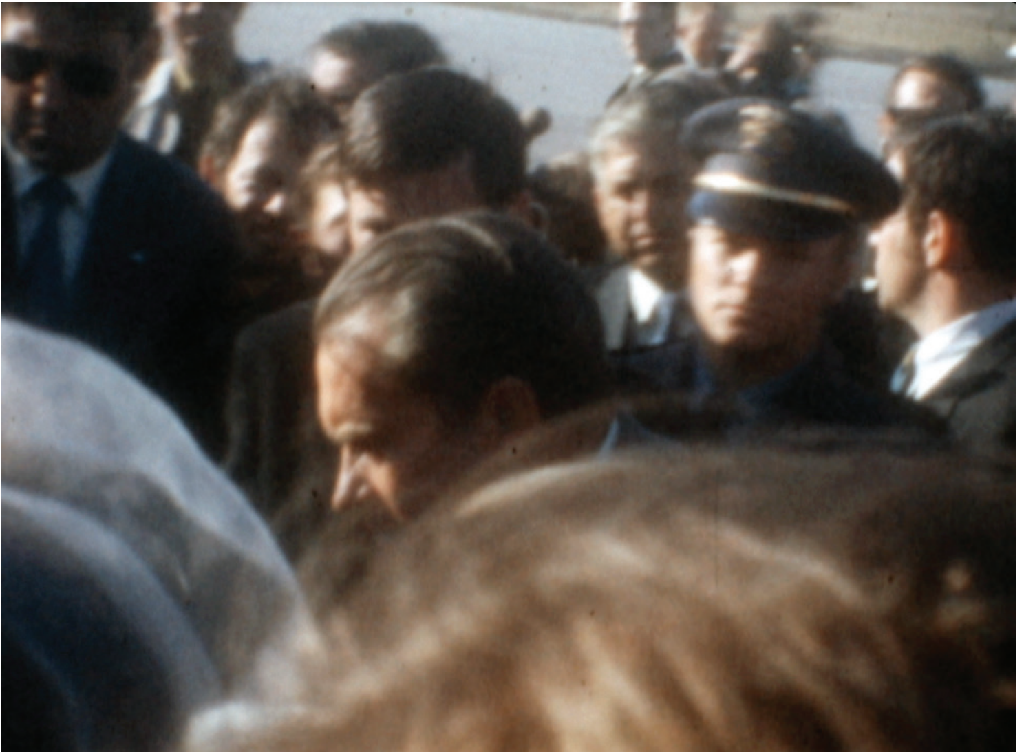
8mm film still: President Nixon, Grand Forks International Airport, ND. 1970. Courtesy Judith Hammer. Collection: College Days Capers: Collegiate Experiences & Capers at UND During "The Revolution" Of The Late 60s & Early 70s.

(*All images in this document are subject to copyright laws)