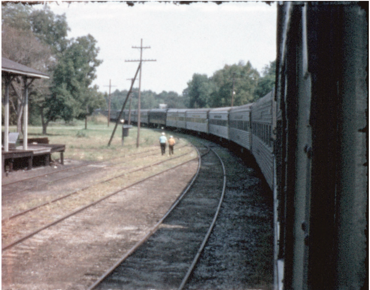
8mm film still: Railway life, c. 1970s.

Considering the size of the organization, however, the fund seems to be successful in providing a needed service to personal heritage conservation and story sharing.